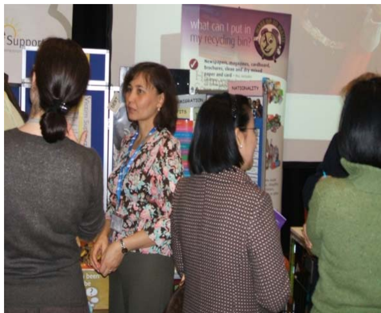
Interpreters helping event attendees

Stand holders found meeting people from our black and minority ethnic communities, as well as the networking and sharing of information that went on amongst them, most valuable.